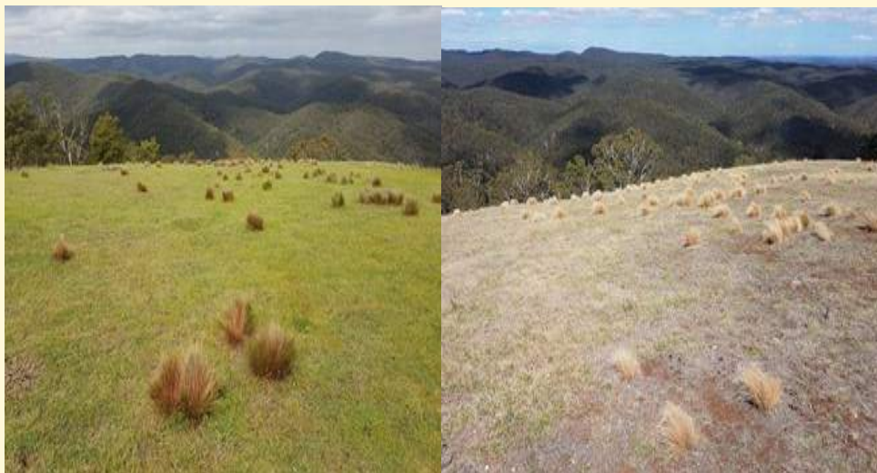
Before and after images of treatments conducted in the Bullengarook area (VSTWP).