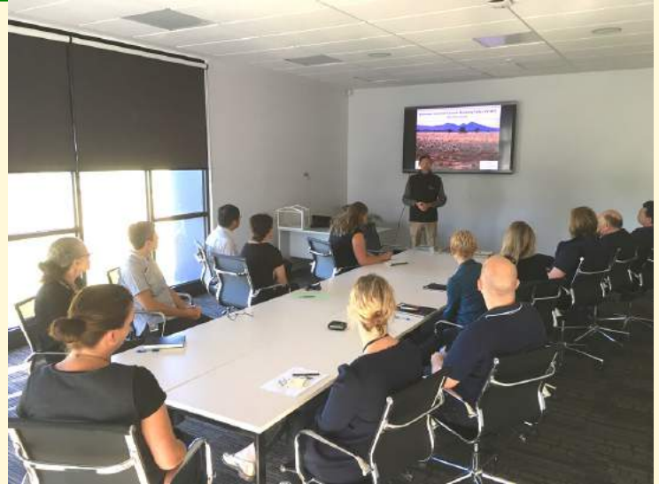
Training staff at Macedon Ranges Shire Council (VSTWP)

If your organization would like training on serrated tussock, please contact the VSTWP for further details on info@serratedtussock.com