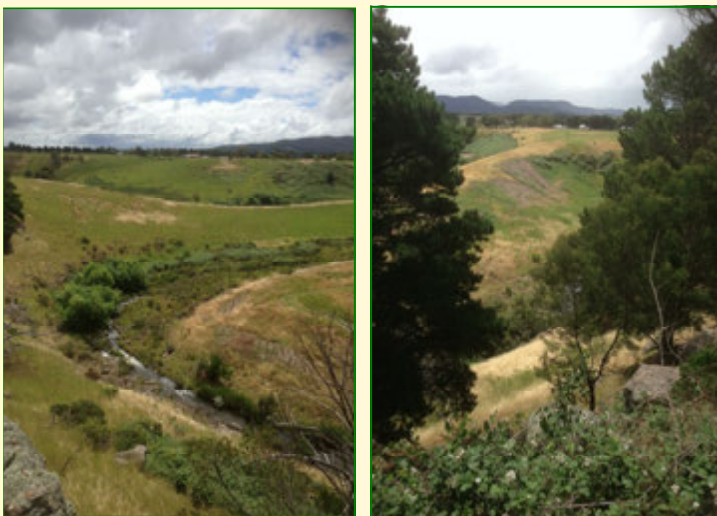
The waterways of Jackson Creek and Riddells Creek.

The VSTWP will commence Stage 2 of the Riddells Creek Extension Project in August 2014 and will launch the project with an information day in July.