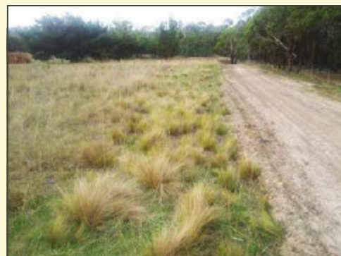
Serrated tussock found on a rural roadside in the Mt Doran target area .

McRaild noted "I've seen some infestations down in the Morrisons area from the roadside that need attention, and I look forward to working with those landholders to assess the scale of the problem and finding the best course of action to remove this scourge to productivity and Biodiversity".