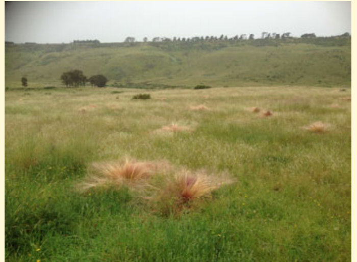
Serrated tussock infestation treated along Jacksons Creek during the project